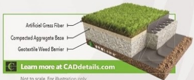
Not to scale. For illustration only.